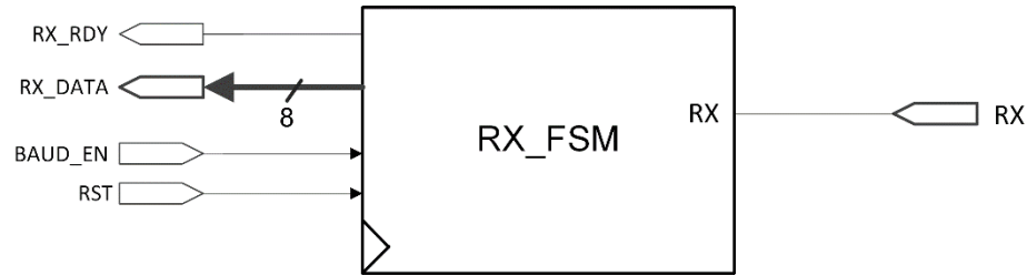
Figure 2: RX_FSM Entity Description

Define a new entity for the receive FSM. The next figure presents the ports of this entity.